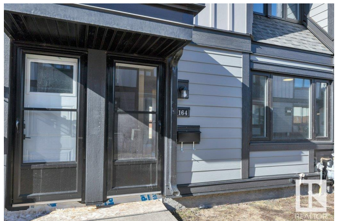
164-3308 113 Ave NW, Edmonton, AB